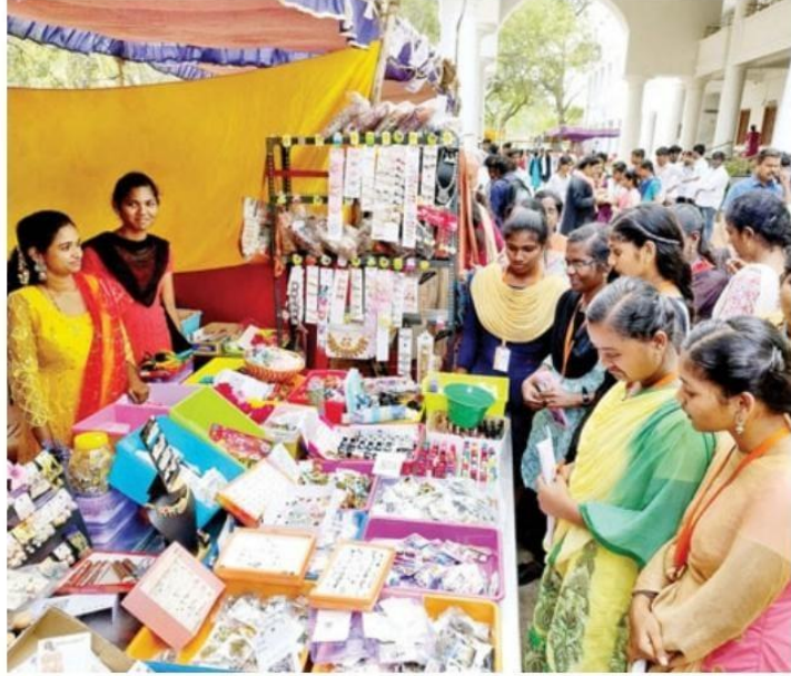
மன்னர் திருமலை நாயக்கர் கல்லூரியில் நடைபெற்ற வர்த்தகக் கண்காட்சியைப் பார்வையிட்ட மாணவிகள்.

கல்லூரி வணிகவியல் துறை மாணவர்கள், முன் னாள் மாணவர்கள் சார்பில் வீட்டு உபயோகப் பொருள் கள், ஆட்டோ மொபைல், இயற்கைவேளாண்பொருள் கள், புத்தகங்கள், ஜவுளிகள், விளையாட்டு சாதனங்கள், கைவினைப் பொருள்கள், அழகு சாதனப் பொருள்கள்,